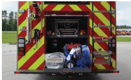
Extremely low ladder through-the-tank storage