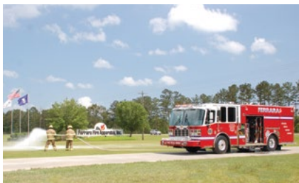
Pump and roll capabilities