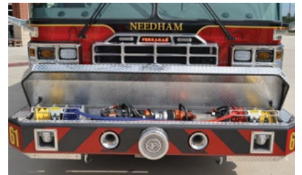
Customized front bumper for extrication tools and equipment