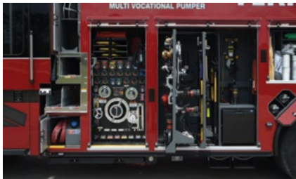
Extra low speedlays