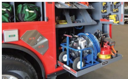
Full depth compartments