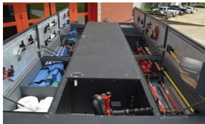
Enormous coffin compartments