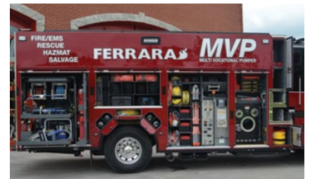
Tailored body compartment layouts