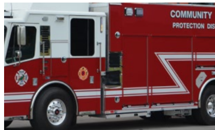
Enclosed pump house compartment