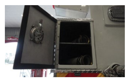
Foam suction hose storage compartments