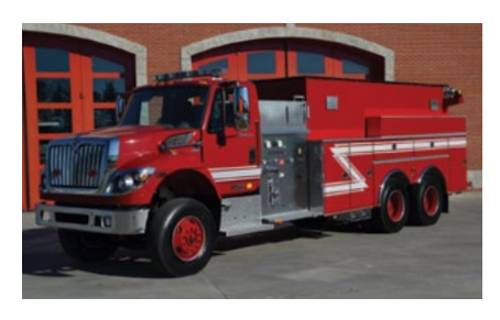
Varied compartmentation configurations for additional equipment storage capability