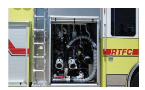
Manifold/monitor modules available with foam proportioning systems