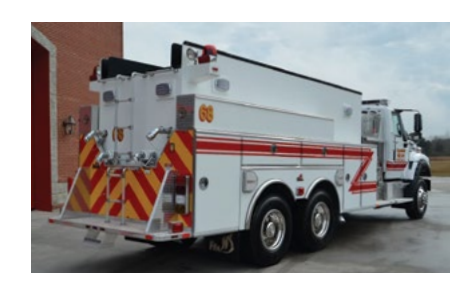
Painted poly wet side configuration tanks