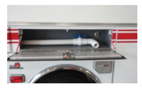
Foam Tote Stinger storage compartment