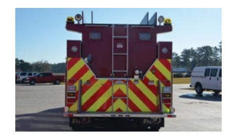
Multiple discharge and direct tank fill options as well as hosebed access ladders