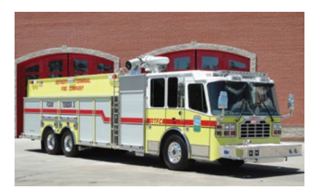
4000 gallon foam tenders with manifold system, foam system, and 8000 gpm monitor