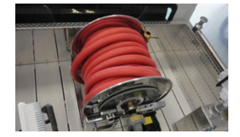
1.5" easy deployment booster reel foam line