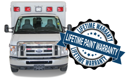
CrestCoat is a durable and cost effective corrosion prevention solution backed by a Lifetime Paint Warranty.

Worry-free maintenance with readily available parts.