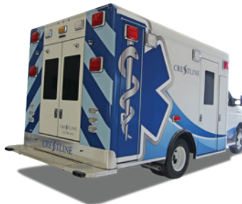
The all aluminum underbody bumper protects the module in low impact collisions.