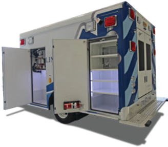
The CCL 150 offers 50.8 cu. ft. of exterior storage space.